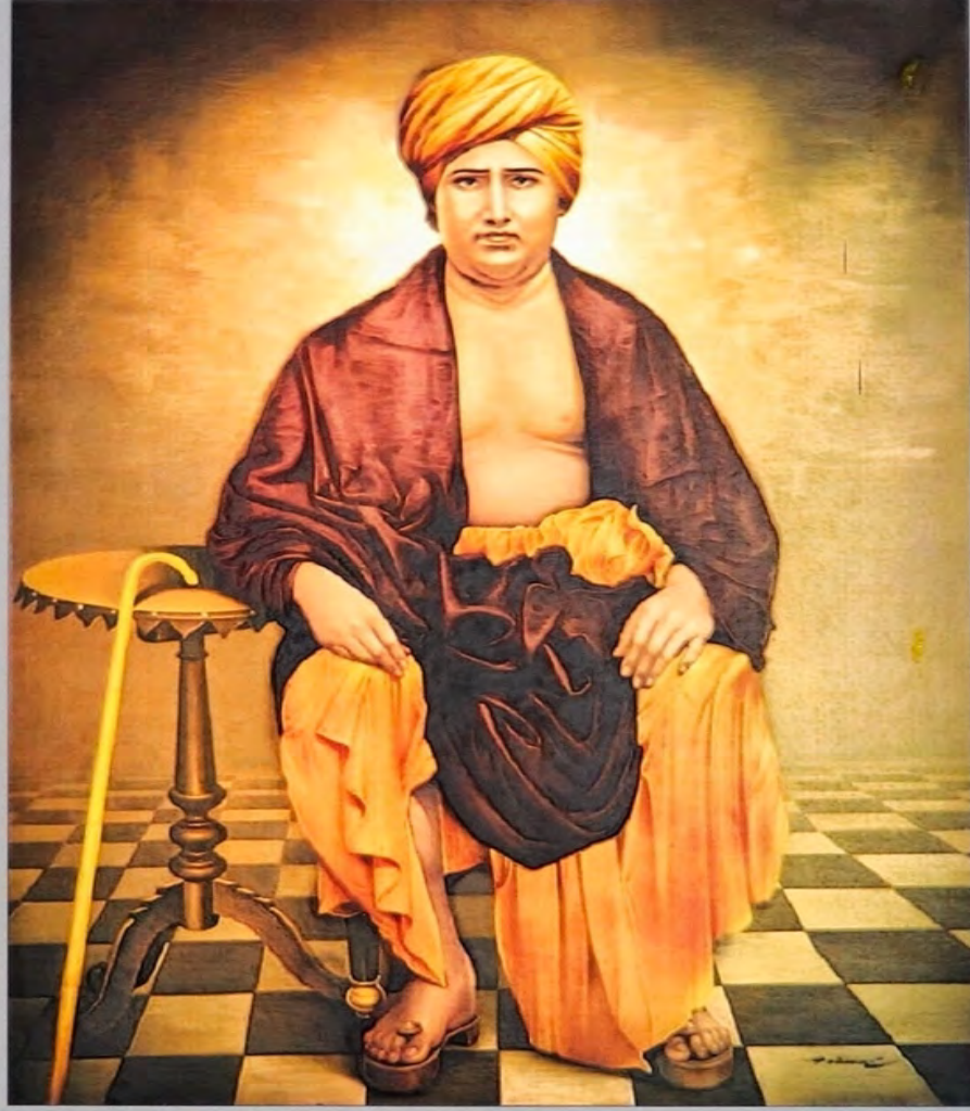
स्वामी दयानंद सरस्वती