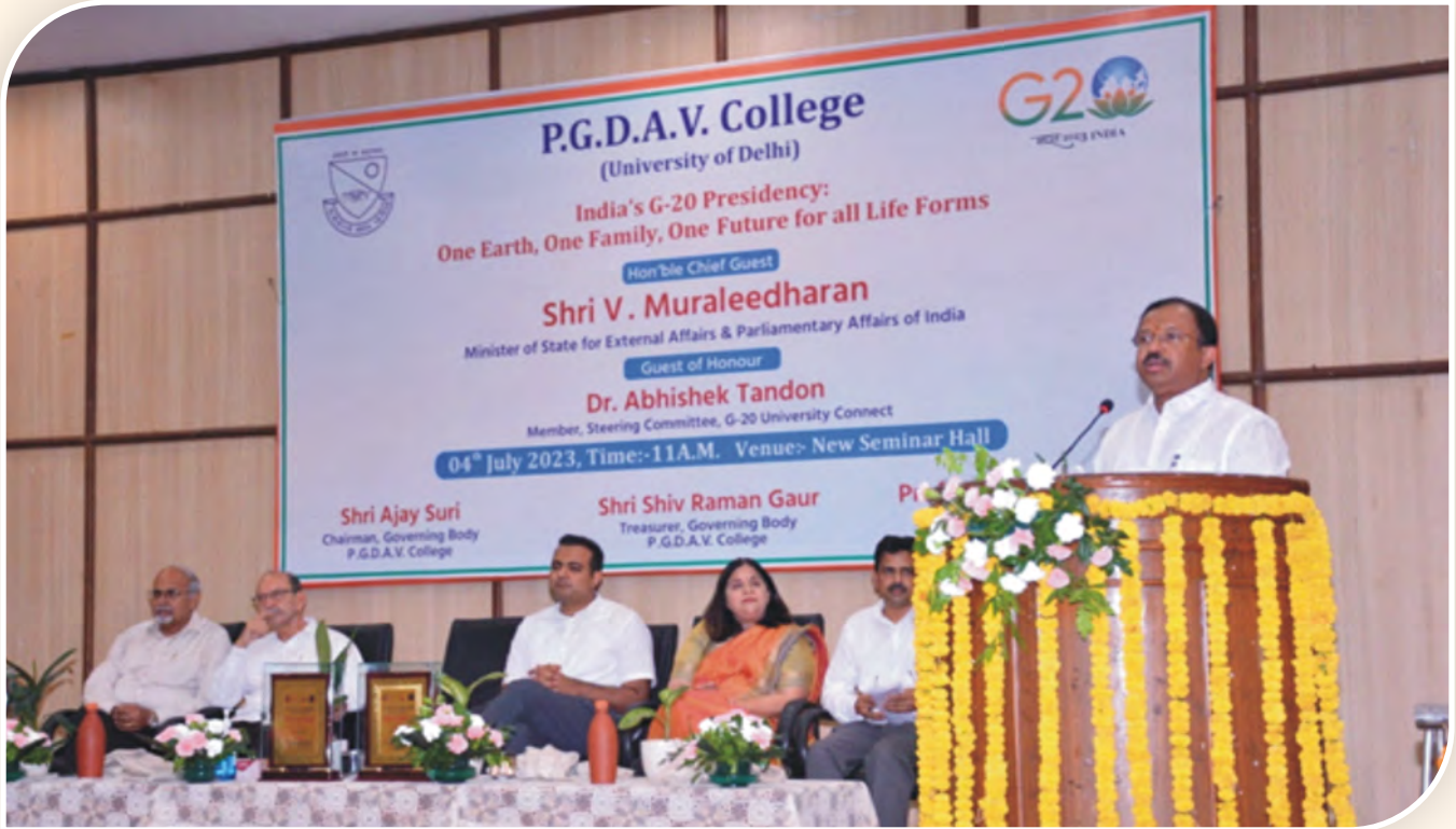
Shri V. Muraleedharan (Minister of State for Parliamentary Affairs of India)