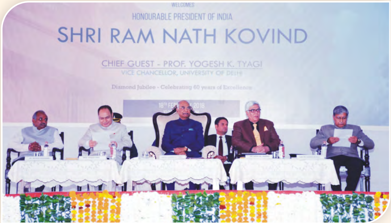
Shri Ram Nath Kovind (Former President of India)