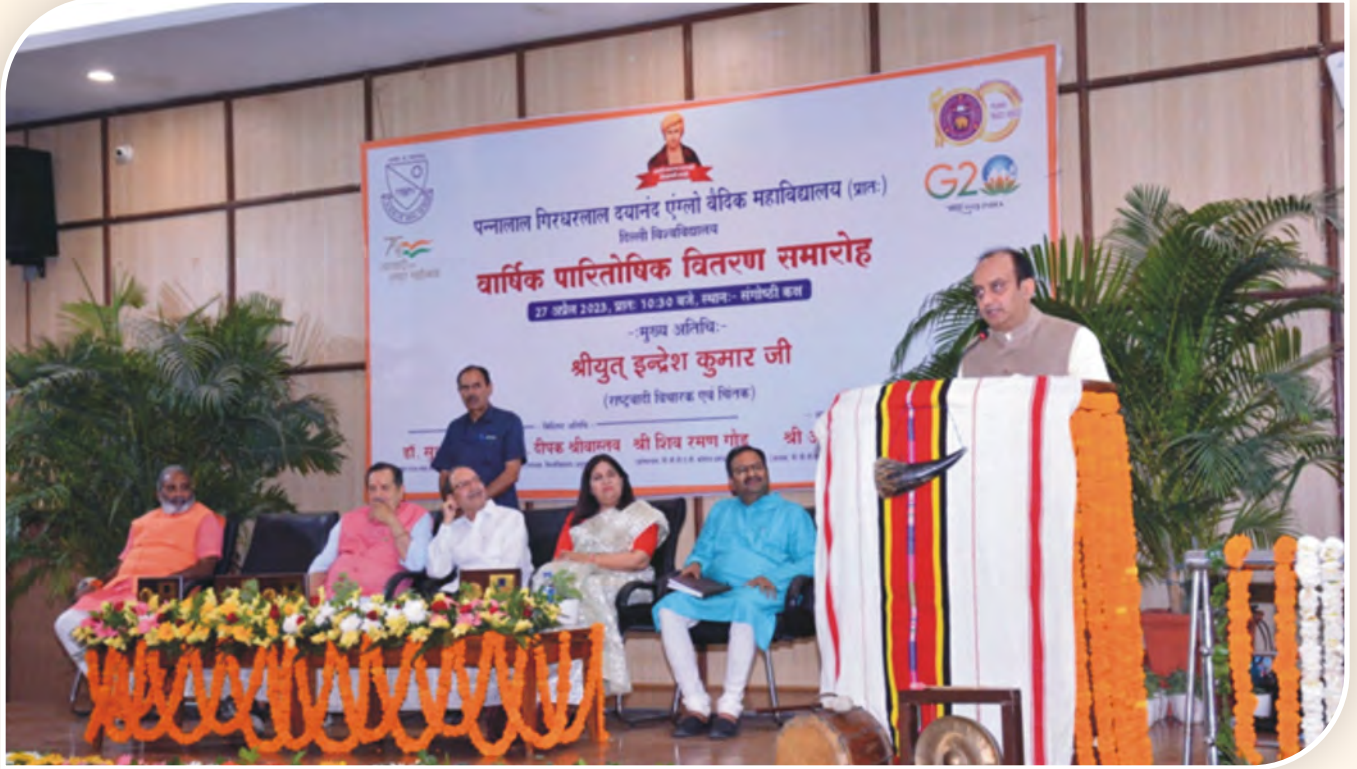
Dr. Sudhanshu Trivedi (Member of Rajya Sabha)