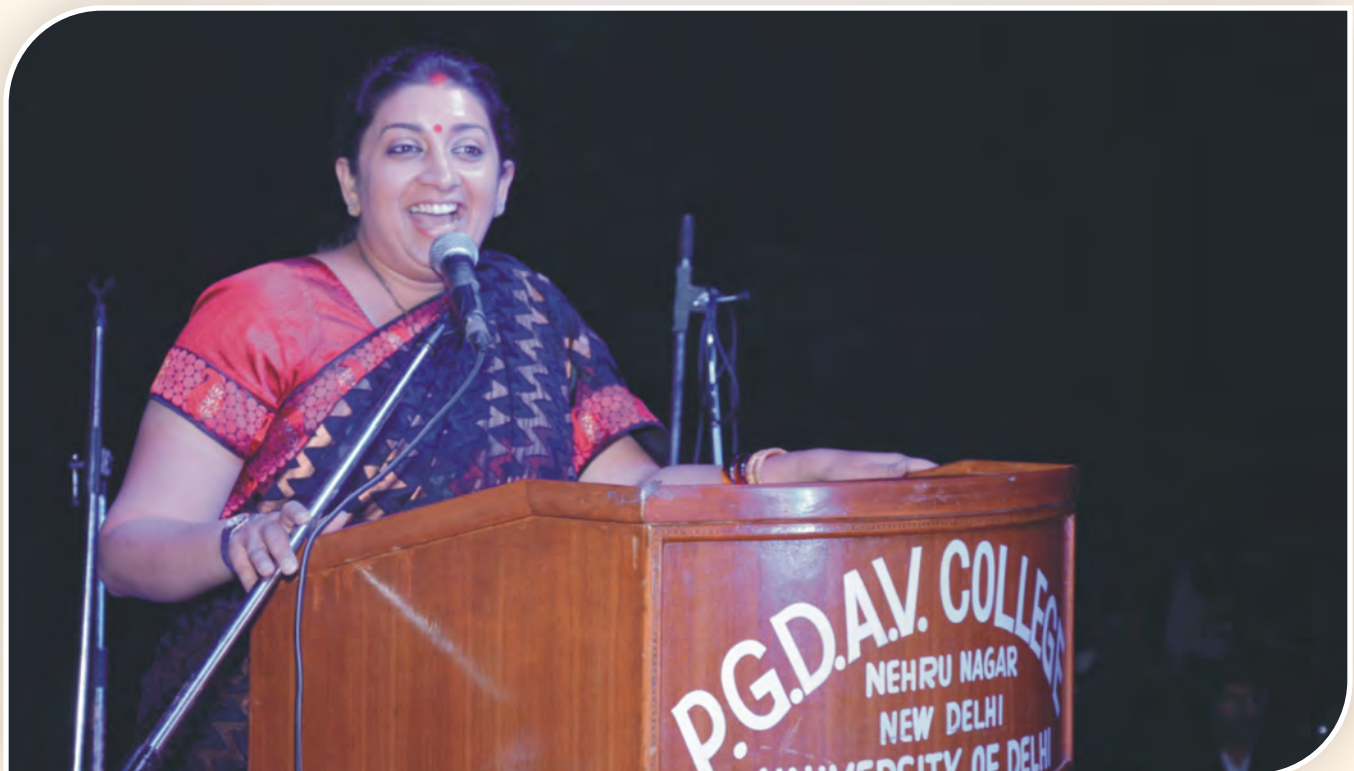
Smt. Smriti Irani (Union Minister Of India)