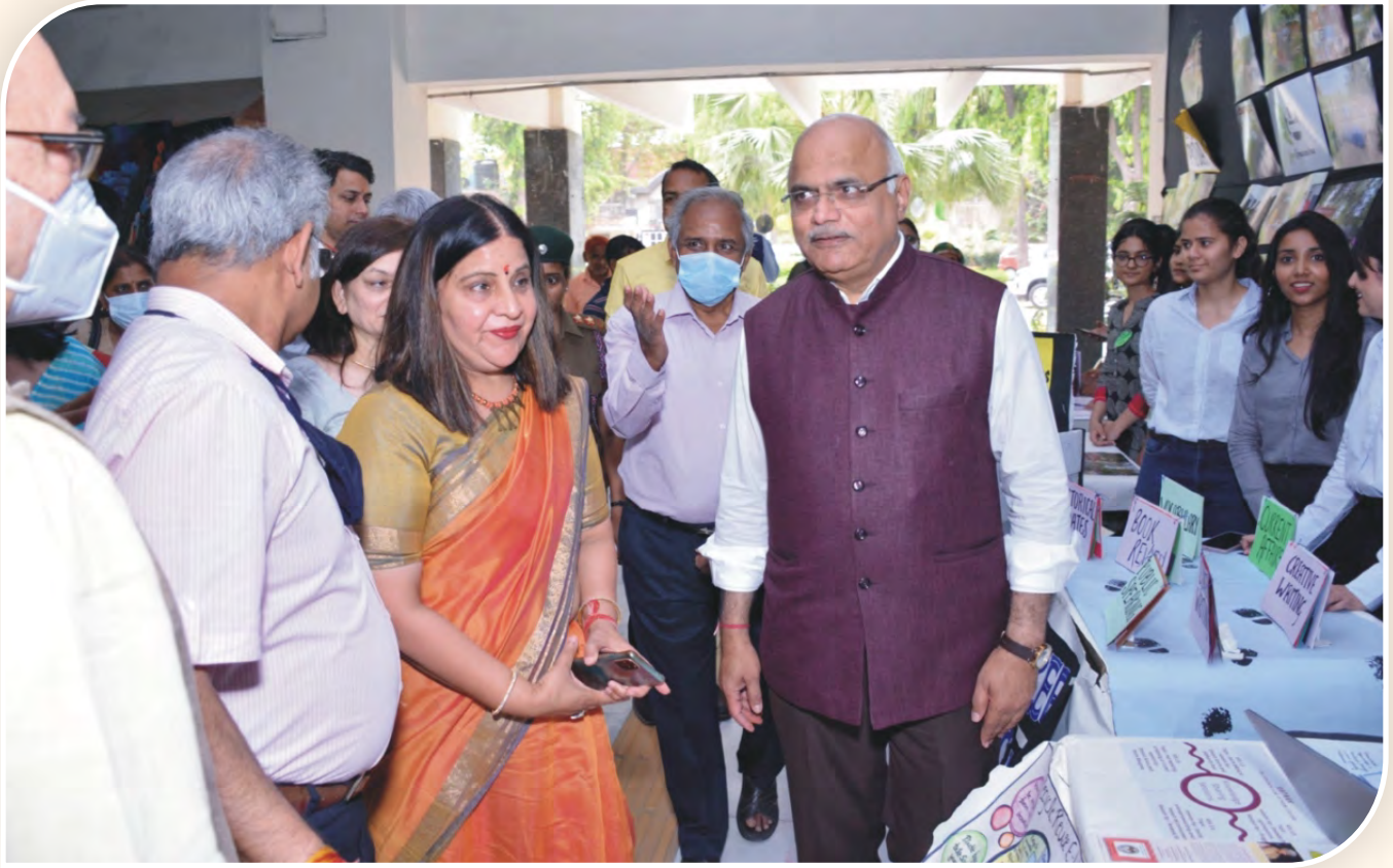
Dr. Vinay P. Sahasrabuddhe (President of the Indian Council for Cultural Relations)