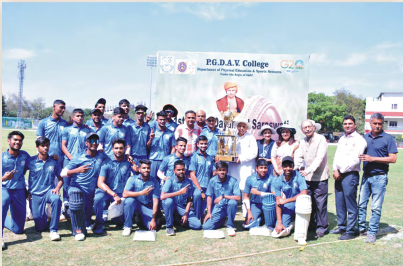
PGDAV Cricket Team lifting the Trophy of Swami Dayanand Saraswati Cricket Tournament

PGDAV College emerged champion in the Swami Dayanand Saraswati Inter-College Day-Night T20 Cricket Tournament organised in March 2023, to commemorate 200th birth anniversary of Swami Dayanand Saraswati. The tournament saw participation of 12 cricket teams of different colleges of Delhi University.