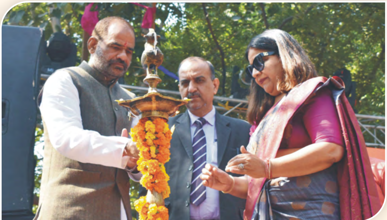
Shri Ramesh Bidhuri (Member of Parliament)