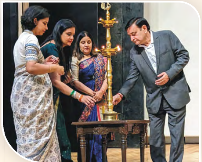
Shri Arun Gemini (Famous Hindi Poet)