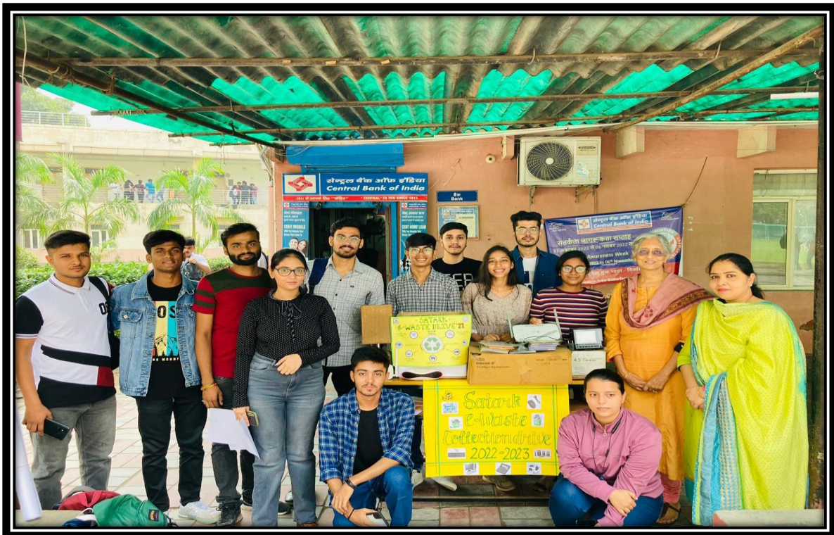
Small steps for a sustainable future!

This year Satark started this drive on 12th October 2022. We collected almost 20 kg of e-waste from the staff and our students.