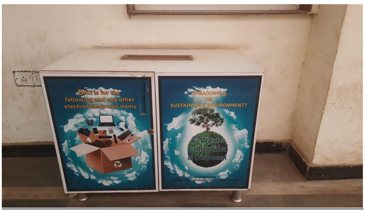
Evidences of Campus Enhancement and Green Audit